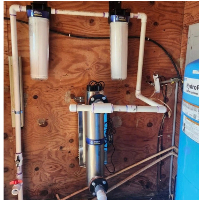
HYDRA by TOMIGUNN combines fine-fabric prefiltration and ultraviolet purification.

For farmers facing issues with clay, sand, or rust, the optional CLEARLINE filter removes large particles. This system starts with a 2-inch CLEARLINE spin-down filter with automatic purge, followed by a pre-filtration stage. Together, these steps remove contaminants such as chlorine, lead, pesticides, fluoride, and pharmaceutical residues. We also offer iron filters, as needed.